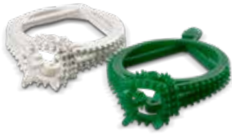
Figure 4 JCAST-GRN 10 is a green material, ideal for small, fine-featured jewelry master patterns for gypsum investment casting applications. This material leaves minimal ash after burnout to produce superior casting quality. Create and produce custom jewelry or other investment castings that capture fine detail with a smooth surface finish.