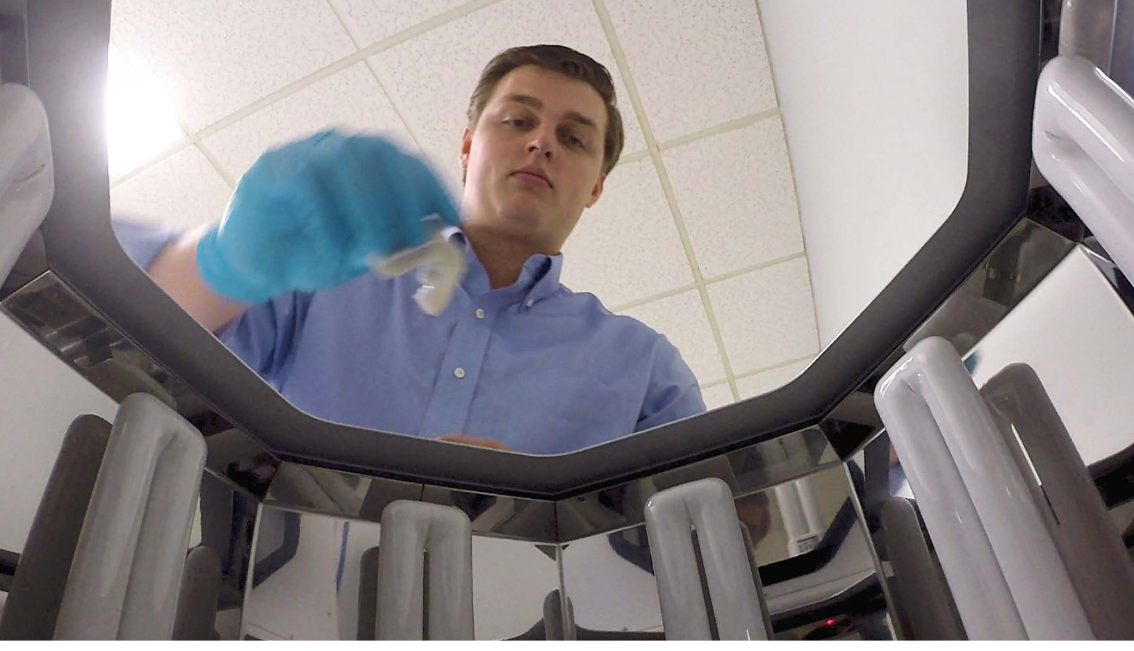
The speed of the NextDent 5100 enables Hybrid Technologies to easily complete 10 to 12 prints a day, in between other work.

versus milling is definitely a positive in more than one area," says Mills. "The cost savings on materials is huge, but by 3D printing you are also able to save the integrity of your milling machine for materials like zirconia."